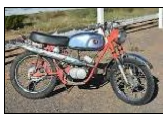
Hadaka Ace 90 Stock photo, 1966