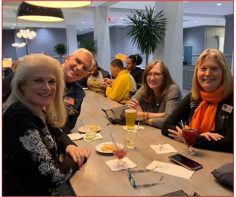
The FAB 4

If you were at the Accident Scene Training this past Saturday, Feb. 22, you probably noticed some regular HOG members missing! They were in "Saturday School" over in Charlotte for the Regional Officer Connection to make our HOG chapter even bigger, better, stronger! We appreciate their attendance at this conference for US!