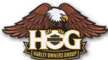
Large Jacket Patch

Much more available at the locked cabinet by the HOG office and the above link!